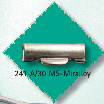
241 A/30 MS-Miralloy